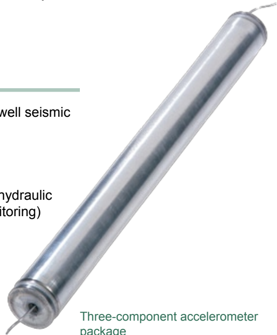
Three-component accelerometer package